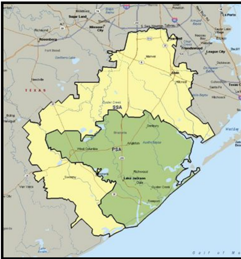
■ Primary Service Area ("PSA") ■ Secondary Service Area ("SSA")

The ADMC service area has experienced rapid growth...and the trend is expected to continue