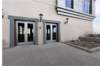
Designated garden bed with sculpture centered. The artwork will be anchored to a concrete base that will include a commemorative plaque.