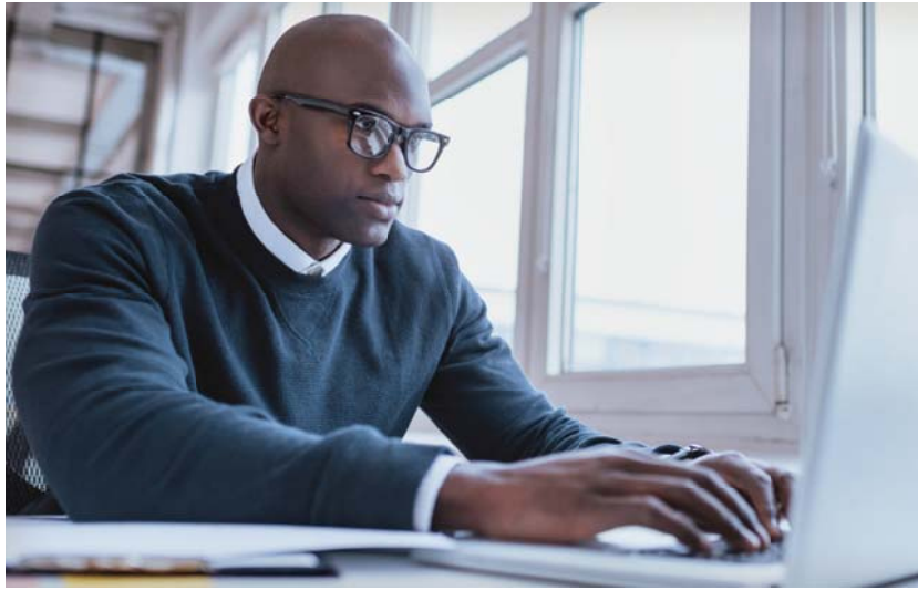
Effective September 1, 2016