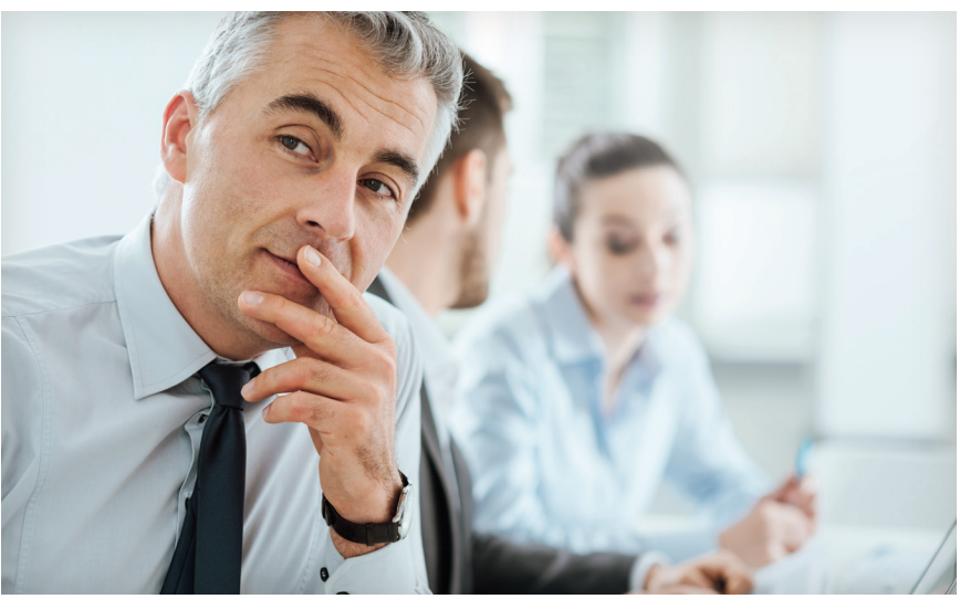
Effective September 1, 2015